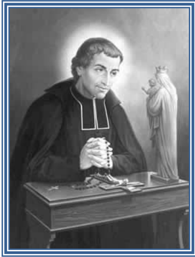
According to St. Louis Marie de Montfort

All for the Heart of Jesus through the Heart of Mary!