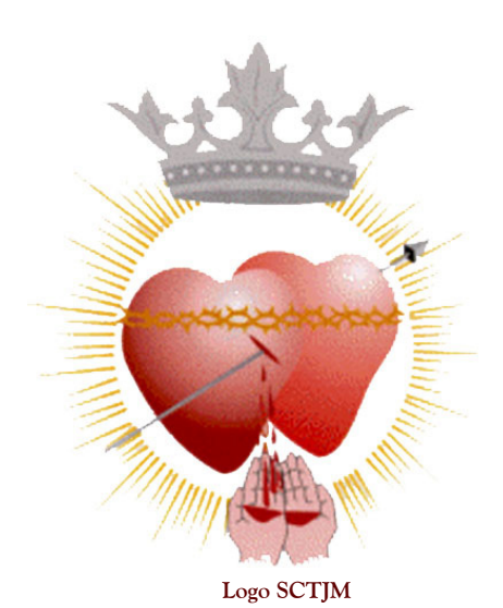
"All for the Heart of Jesus through the Heart of Mary."