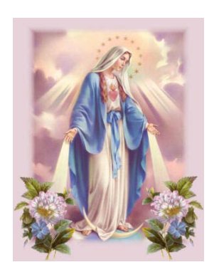
When you finish, pray the Hail Mary